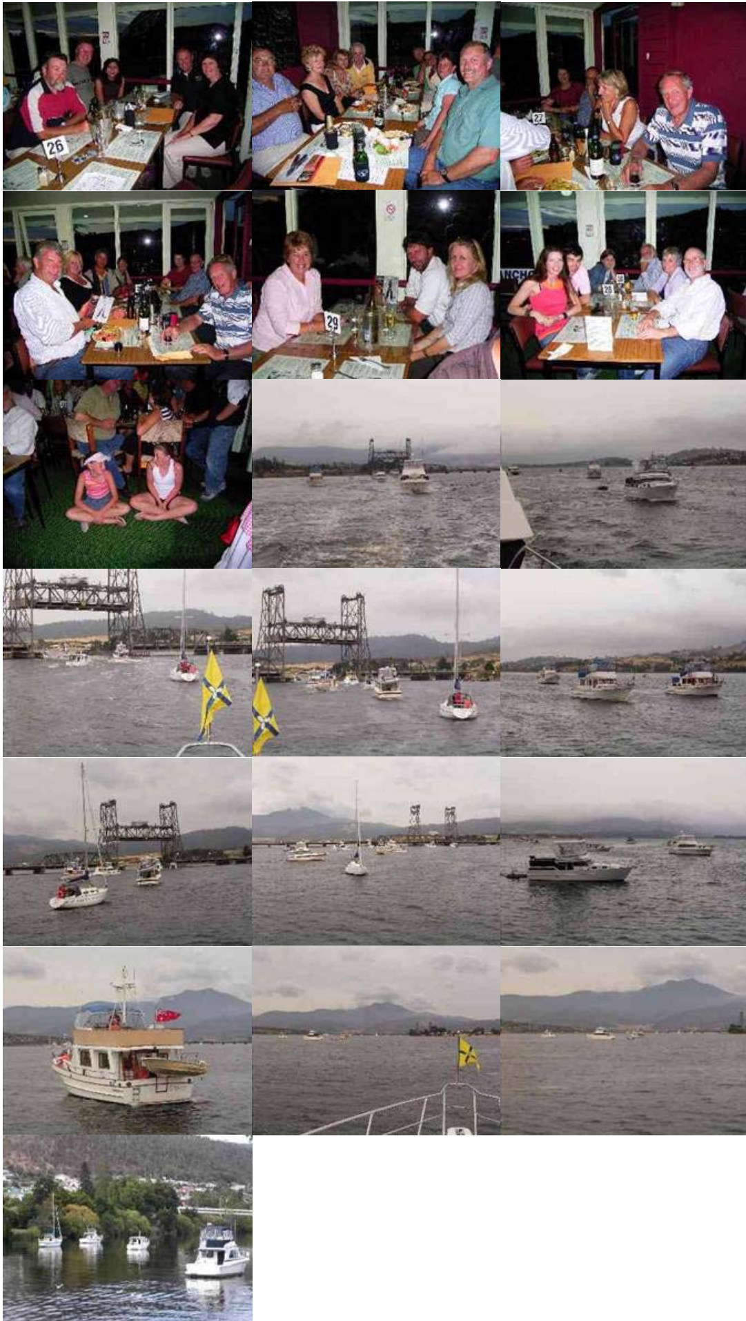
Tales from the Engine Room