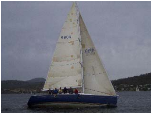
Blue Chip (Colin Denny)