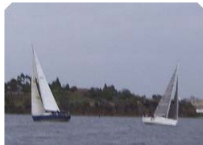
Totally Wild - Blue Chip