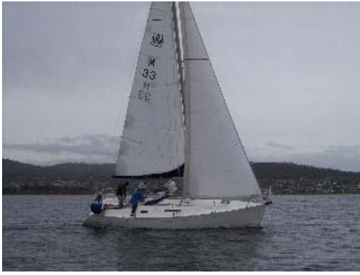
Orizuru (Koje Hatano)