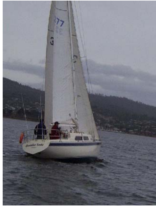
Cavalier Lady